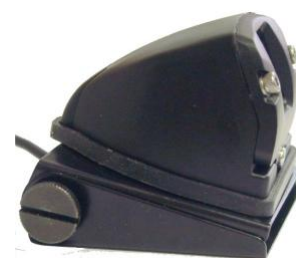
ASTC45 mounted on tilt bracket